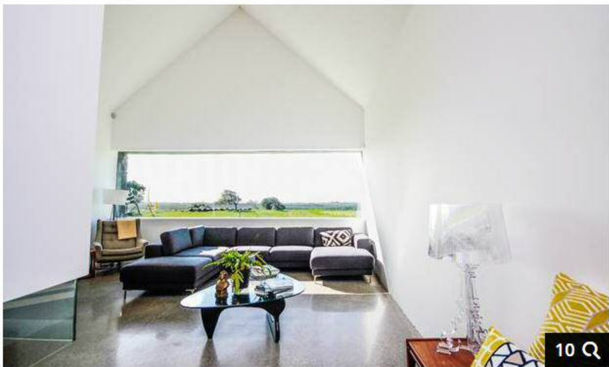
Louise McGuane and Dominic McCarthy's Co Clare cottage: The living area in Louise and Dominic's home in Clare

Upon entering the home, the couple's focus on volume and height is evident with double height ceilings stretching to the roof of the build, the hall finished with large flagstone tiles.